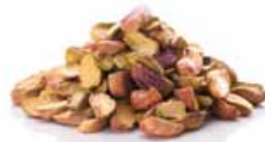
Halves &amp; Pieces