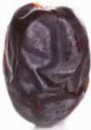
Mazafati Dates (BAM)