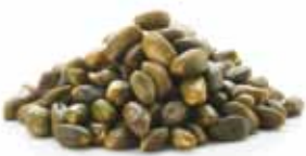
Whole Green Kernels