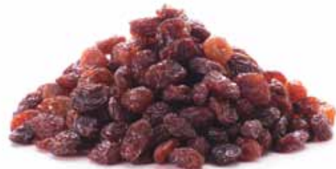
Sun Dried (Seedless)